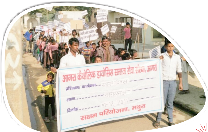
AIDS Awareness Rally