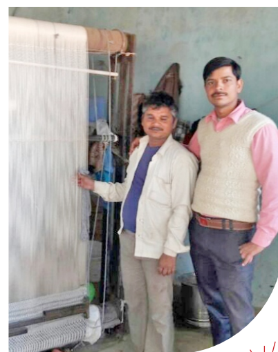
Meeting with Loom Agents